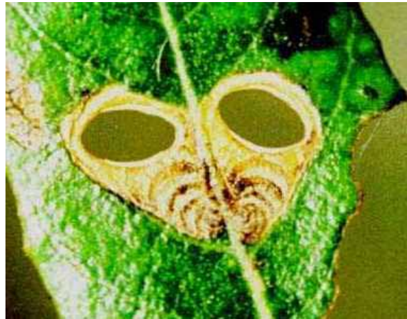
Scale damage to leaves

As insects are classified the scale insects belong to the Order, Homoptera (Greek homo-, meaning the same + Greek pteron, meaning wing. Homoptera include many commonly known insects such as cicadas, leafhoppers and aphids. Under this order they are in the family Coccidae (relating to their having a spherical or spheroidal shape). These insects have a very unique and interesting life-cycle that in fact camouflages and hides it from detection, particularly from the untrained eye.