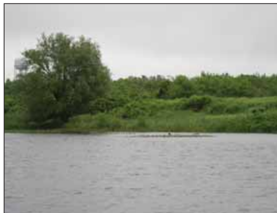
Future site of the SRMT Environment Division on the Raquette River

The St. Regis Mohawk Tribe Environment Division acquired funding for a project that incorporates green building principles as the Environment Division develops a conceptual design for a new Environment building. An important part of the "Green Building for the 7 th Generations" project is community involvement. Two-way communication between the project team and